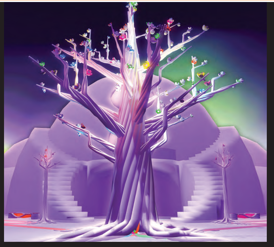
Skawennati, Celestial Tree: She Falls for Ages (detail), 2017, image courtesy of the artist.