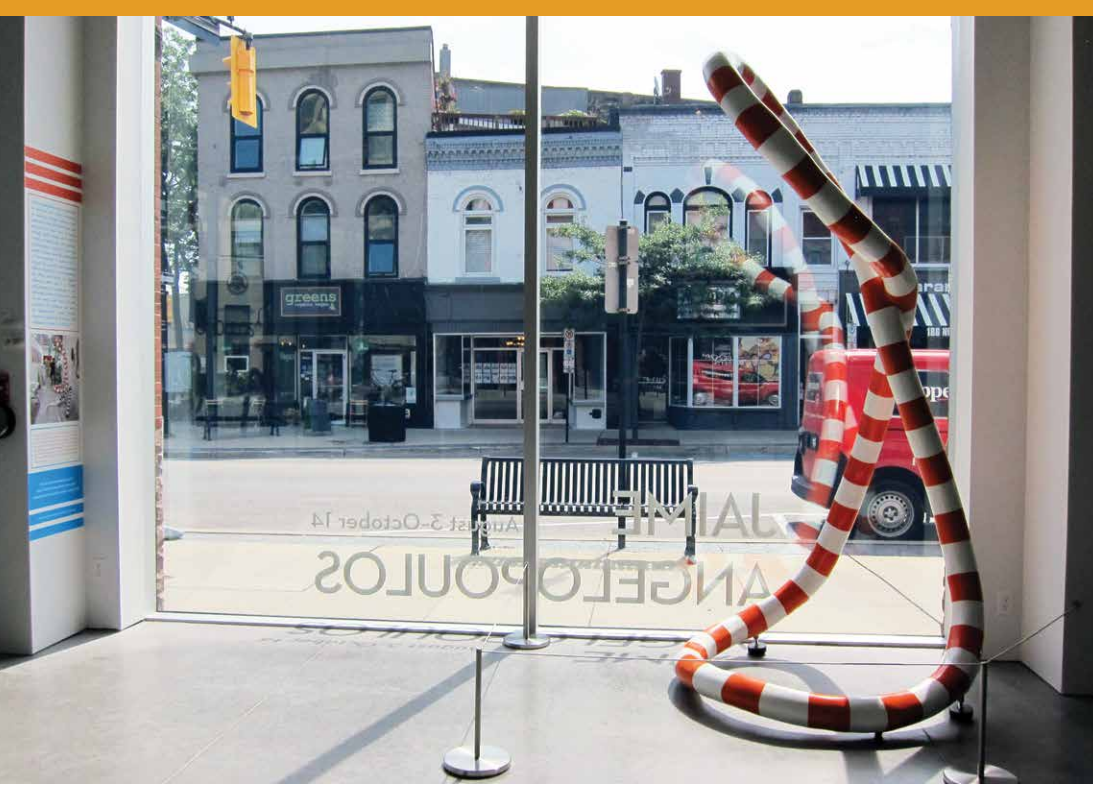
Jaime Angelopoulos, Rise Up, 2014, installation view