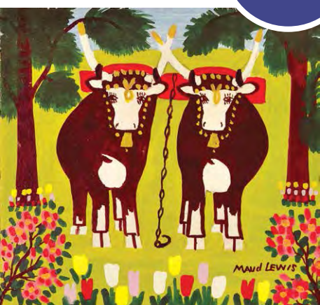
Maud Lewis, Untitled, c. 1966, oil on board

An exhibition dedicated to the particular niche of the gallery's permanent collection which features art that is appreciated for its extreme individuality and inventiveness.